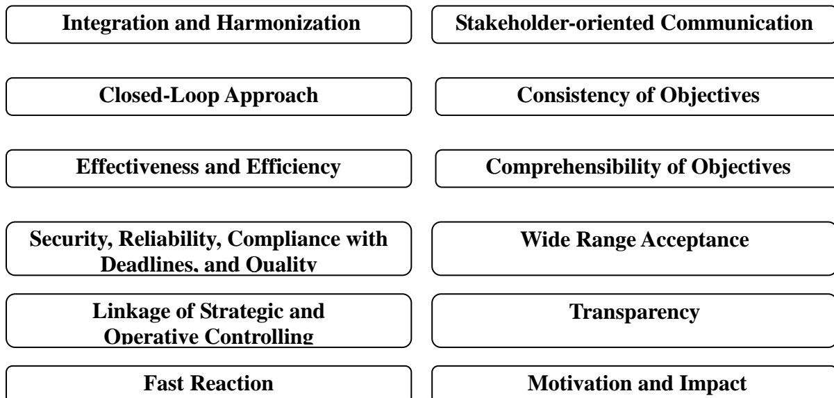
Figure 1. Overview of the Requirements of a Holistic Performance Management

Only if the acceptance of performance requirements has been established in the wide range of the company, can one assume that performance management is established throughout the company. When all members of the organization provide their potential and energy for the overall objective, the company's success should be ensured long-term. The figure below displays the requirements of a holistic performance management.